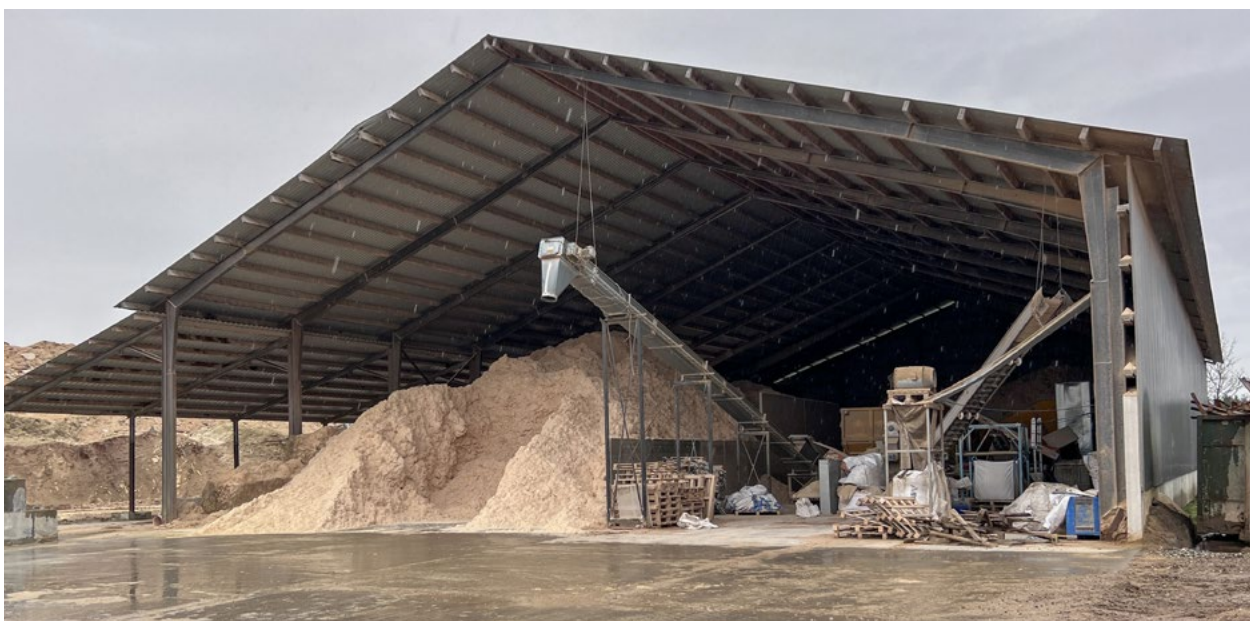
The North Trade House facility.