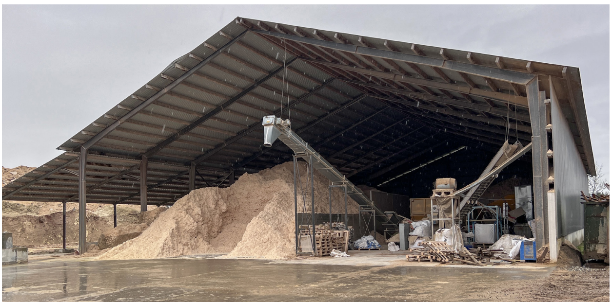
The North Trade House facility.