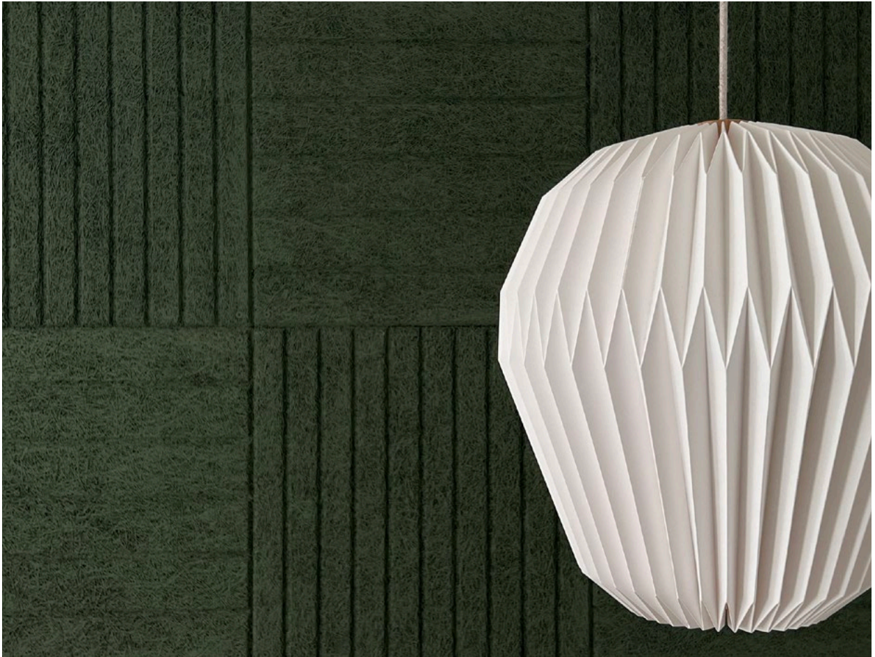
Troldtekt wall deco / v-line is mounted on battens or other suitable substrate.